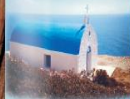
Church of St. Nicholas in Strongyli

the most treasured piece of the Greek motherland