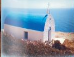
Church of St. Nicholas in Strongyli

the most treasured piece of the Greek motherland