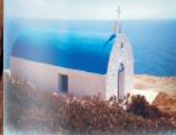
Church of St. Nicholas in Strongyli

the most treasured piece of the Greek motherland